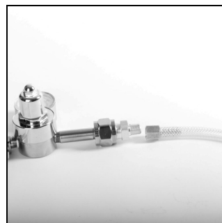
Fig. 2: Connect the Perlage regulator to the CGA 320 adaptor.